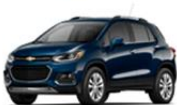
Blue Steel Metallic (G35)