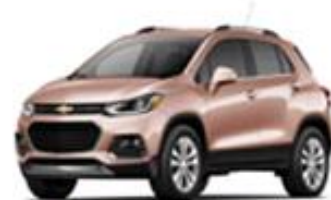
Brown metallic (G8K)