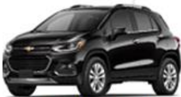
Black Onix Metallic (GB8)