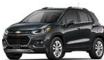
Dark Gray Metallic (G7Q)