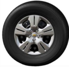
16" steel (RRY)