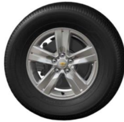
16" aluminum (RRZ)