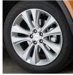
18" aluminum (RRS)