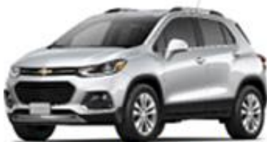
Bright Silver Metallic (GAN)