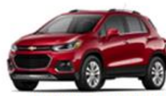
Red Cherry Metallic (GPJ)