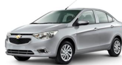
Galaxy Silver (GIY)