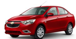
Red Cherry (G8B)