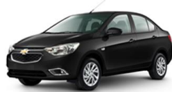
Black Graphite Metallic (GB8)